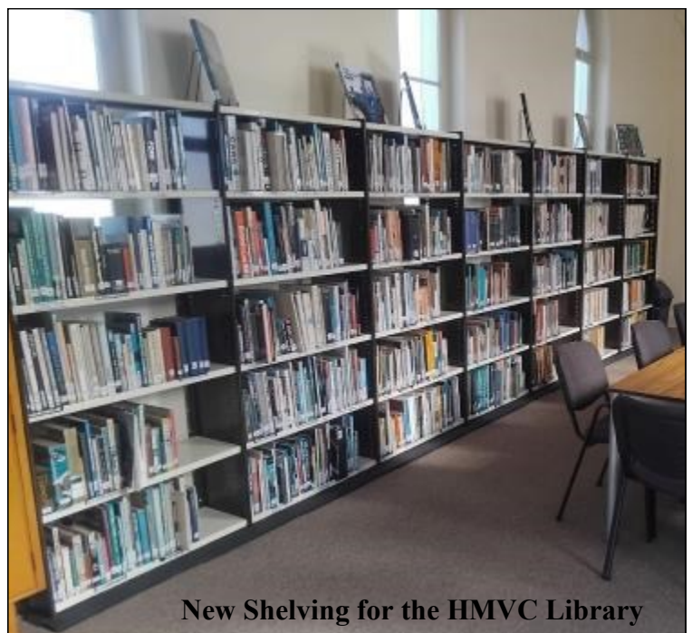
New Shelving for the HMVC Library

REMEMBER, the Library is open to Members from 6.00pm on Meeting nights!