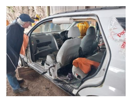
Bruce Kerr checking out the work

After the belts were loosened a bit, the crowd mingled in the newish (2003) extended shed with the fire crew, and looked over and crawled into the range of trucks that were housed there. The changes in design that have