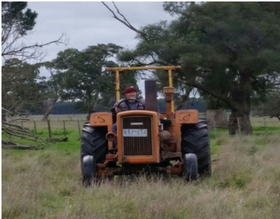
Nearly Trek time