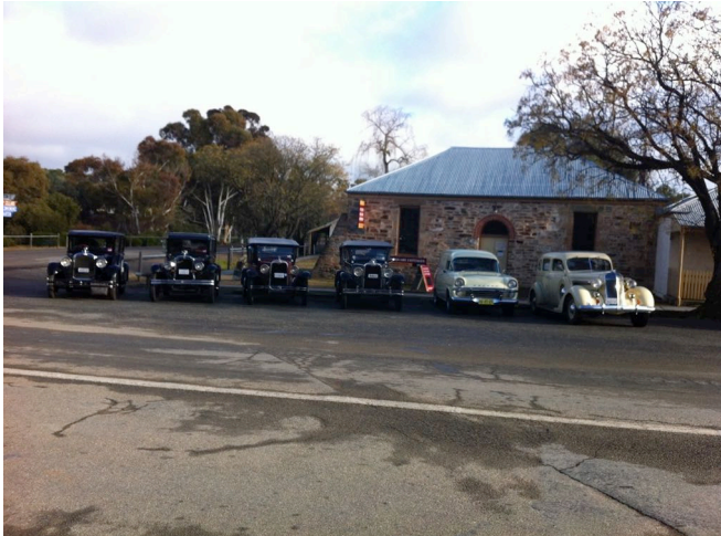
Lined up at our Luxurious accommodation!