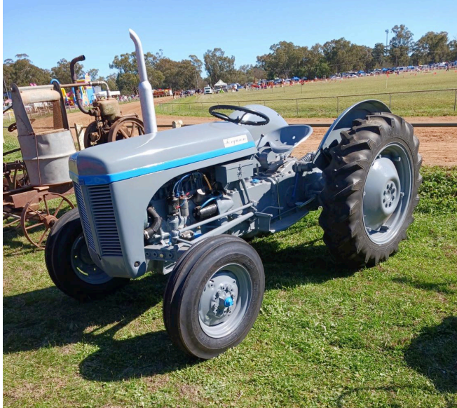
Contributed Craig K