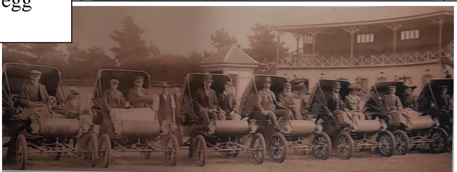
1905 - A line up of cars taking part in a rally, leaving from the Aspendale Racecourse.