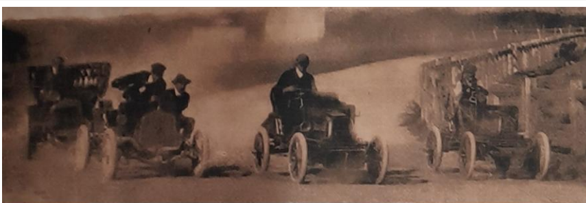
29th January 1906 - The first Automobile race at Aspendale.