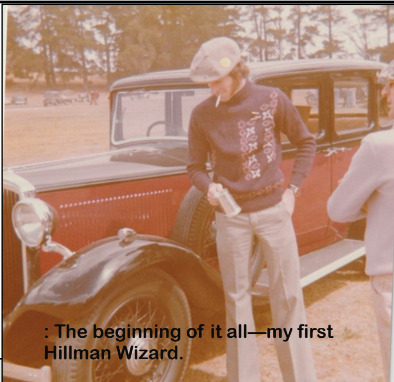
: The beginning of it all—my first Hillman Wizard.

Not long after, we came across a better one ..... a 1933 Hillman Wizard 7. The first was used for parts, and the second has been on the road since 1978.