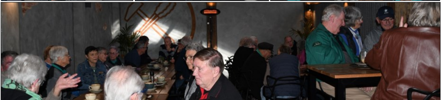
Dub'ling up at Strath!