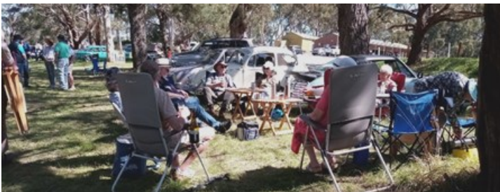
HMVC group enjoying their picnic