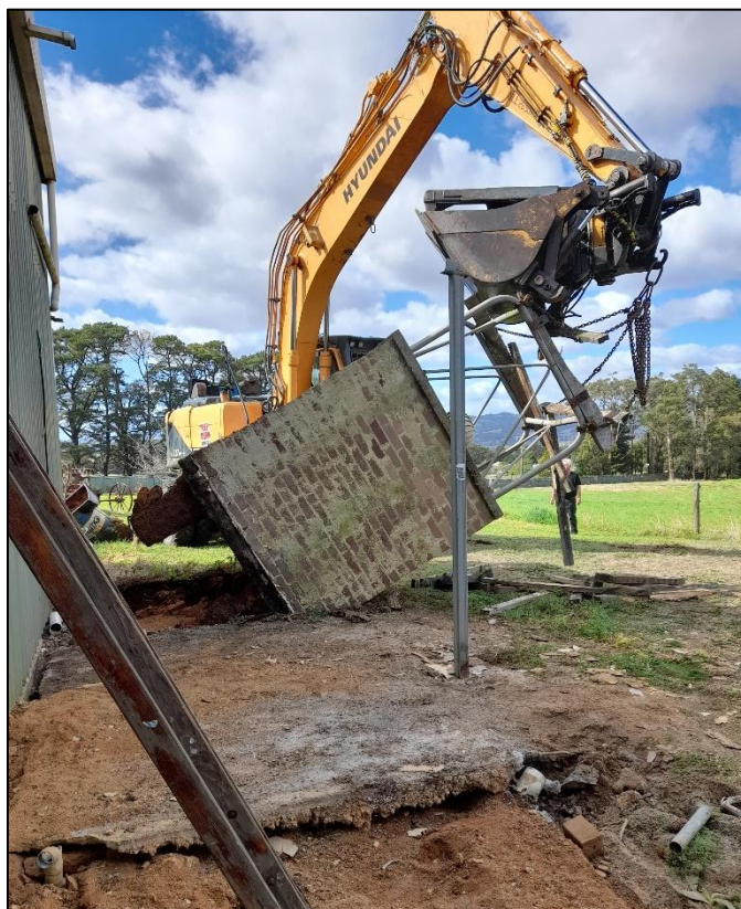
Working Bee at the Shed