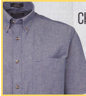
Men's Chambray Shirt