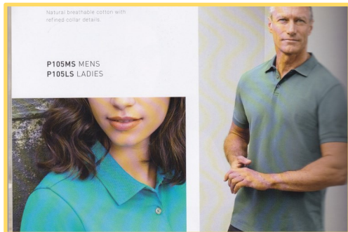
Cotton Polo Shirt