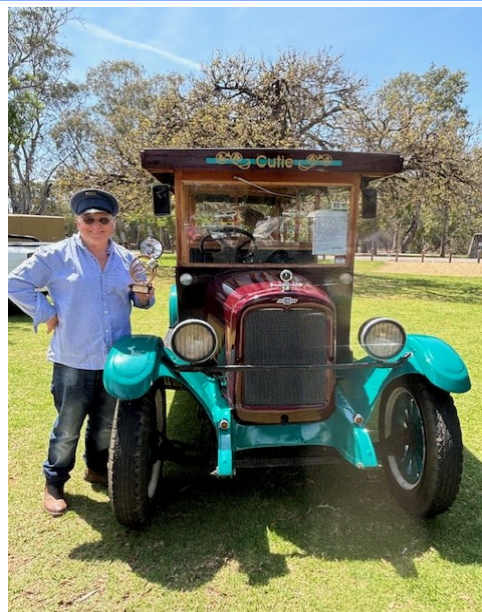
A Good Oldie