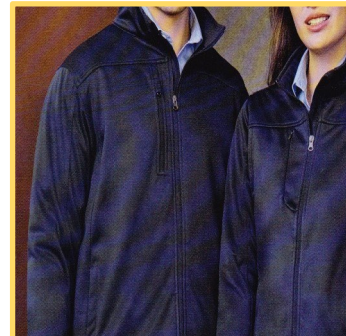
Soft Shell Jacket