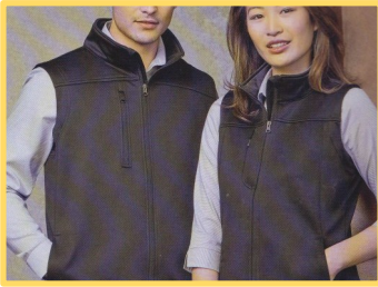
Soft Shell Vest