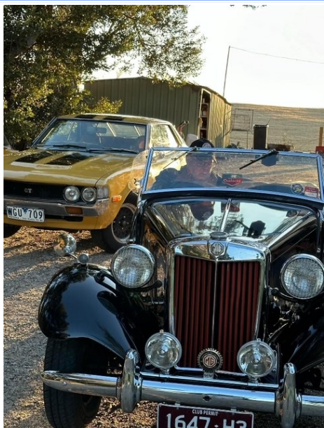
Ready for the RUSH WEEKEND