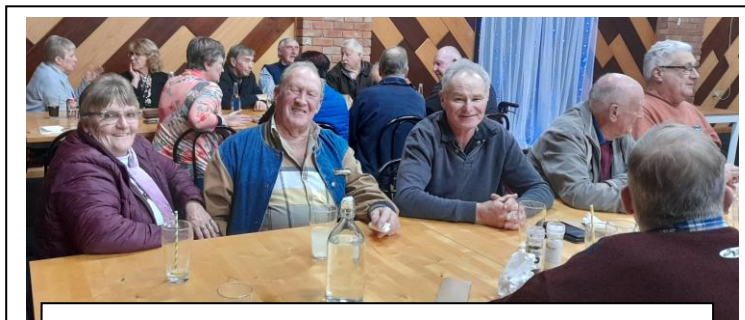
Members enjoying a great meal and chat.