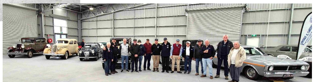
Drivers lined up in front of the display