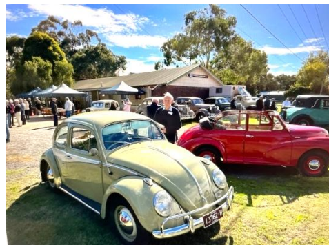
The VW was one of the feature cars at the Clubrooms Farewell Lunch in April 2024.