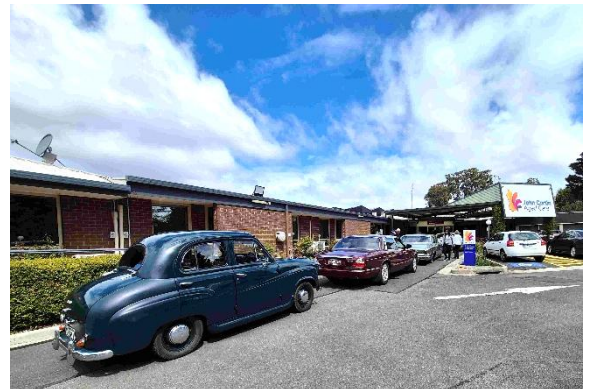
Nerene's A30 brought up the rear of the line up