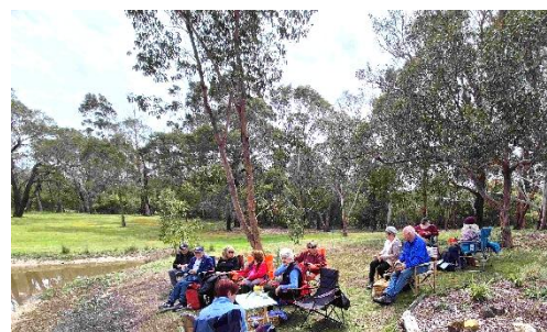
A very restful and peaceful spot to have lunch