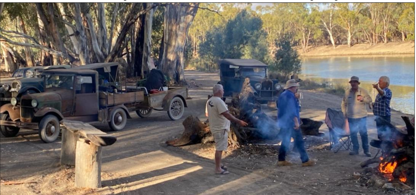
Above: Big challenge the next morning to get up and out to Kulcurna by 0600!