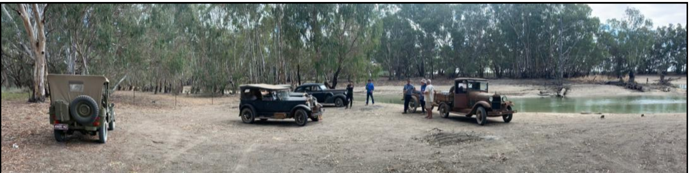
Above: We reached the gravel at about 10.00 and decided to have smoko at Scatting's bridge / Lock 8.