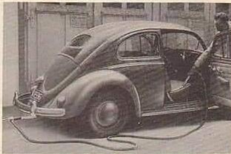
It is that easy to handle the Dust-Ex