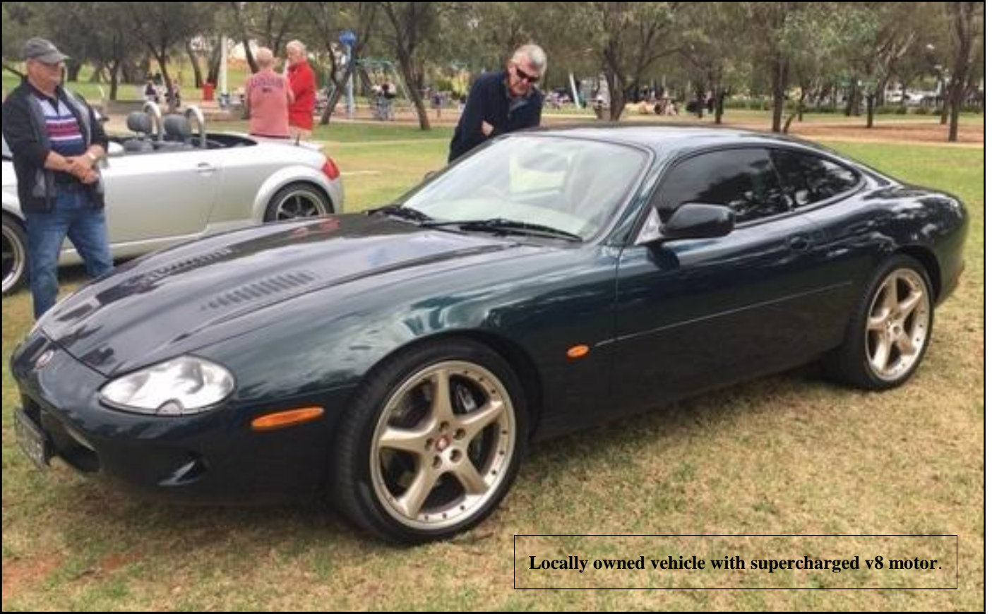
Locally owned vehicle with supercharged v8 motor.