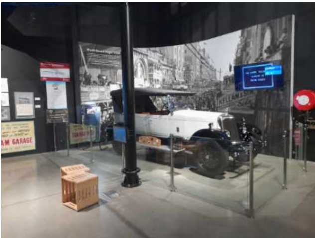
Hinkler Aviation Museum Bundaberg Bert Hinkler's actual car his Armstrong Siddeley located and restored by local historic vehicle club members