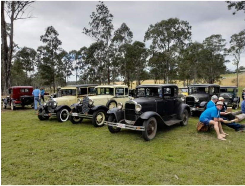
Morning tea—Lychee Farm