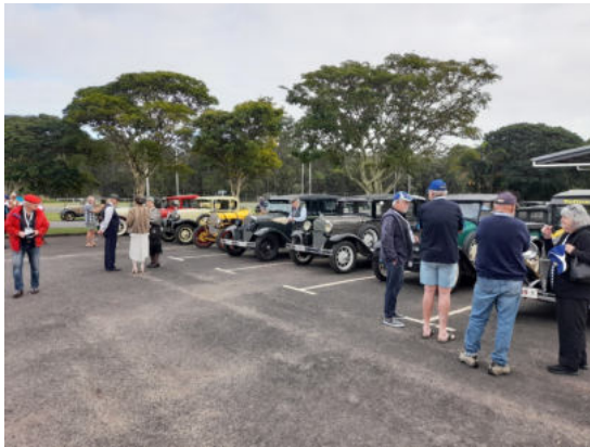
Registration Maryborough Showgrounds