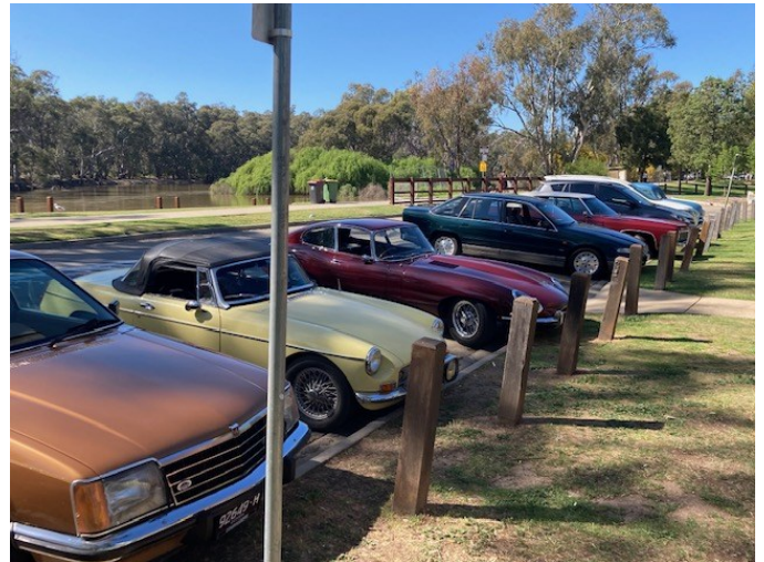
Morning tea at Riverside