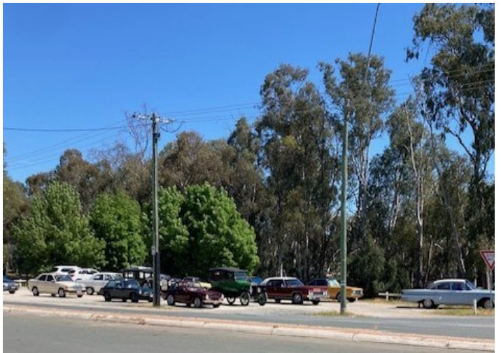
Assembled at Tooleybuc Pub