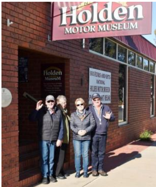
Photo by Colin Pierce: Werribee & District Collectable Vehicle Club.