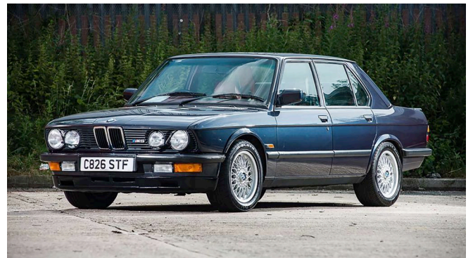
1985 BMW M5

In the late 1980s, car manufacturers began using urethane and polyurethane paints on their vehicles. After the application, clear coats were then applied. This resulted in durable and highly glossy finishes.