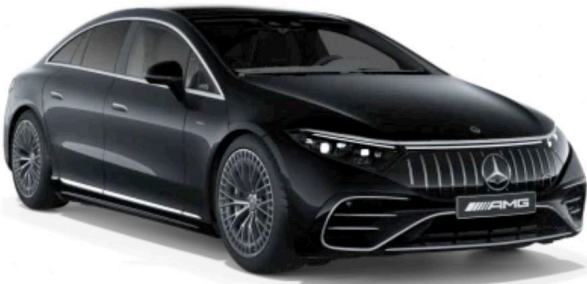
Current Mercedes AMG EQS

All displays were excellent, covering a wide variety of interests.