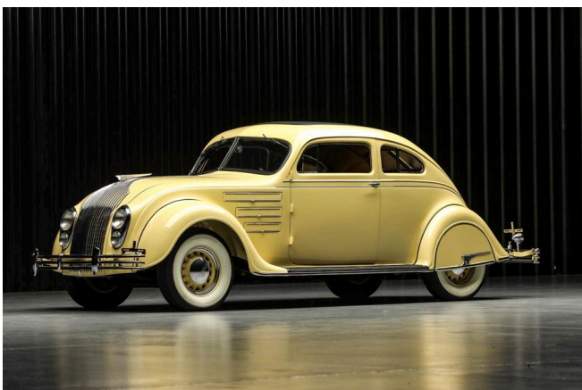
1934 Chrysler Airflow Coupe

This was the first “Polymer” based system and the chemistry forms the basis of today's coating technology.