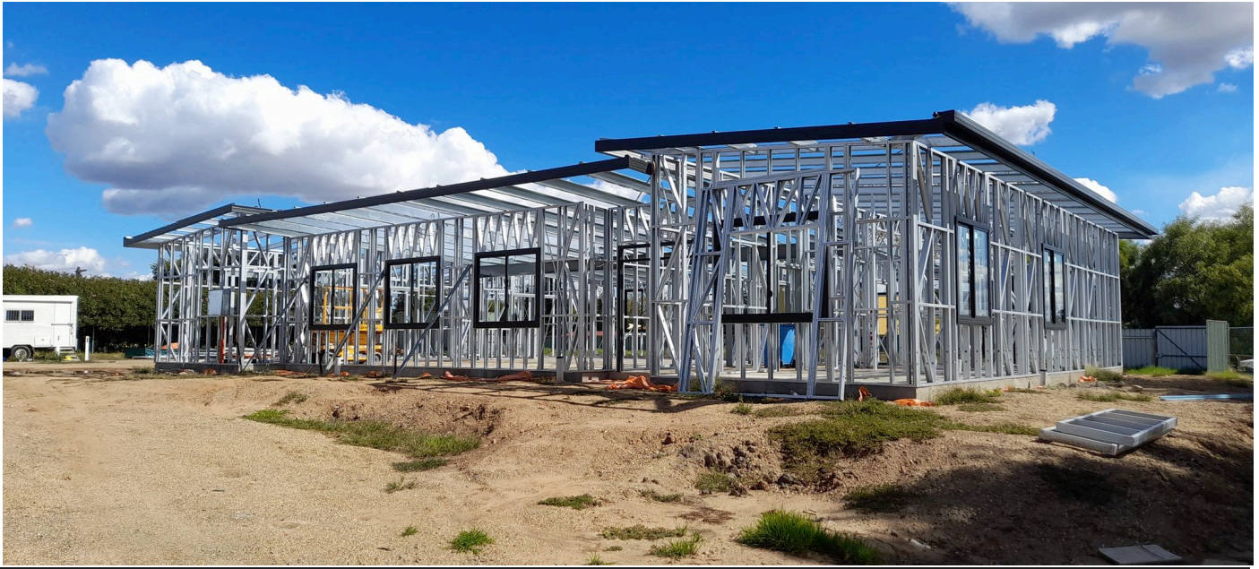
5 th April