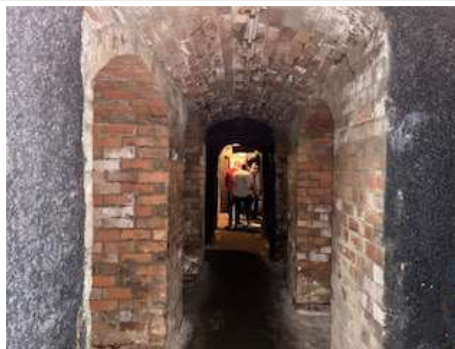
Some more underground 'Drives'. Thousands of bottles stored in a 'Drive'