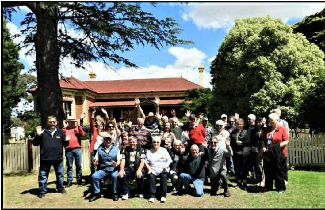
Goldfields Group at the Historic Seppelt Mansion "Vine Lodge" -----

Attendance included 37 members, 2 guests and 2 children