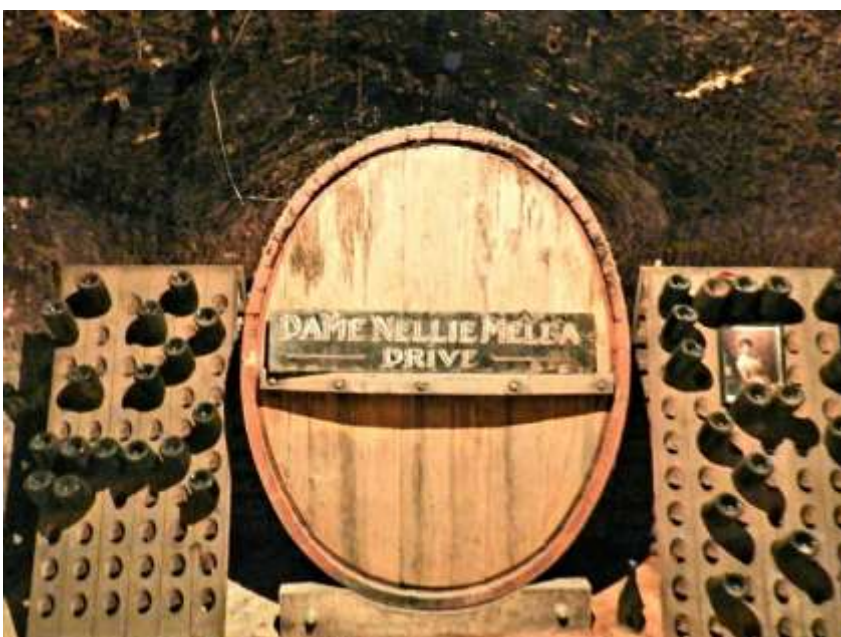
Dame Nellie reputedly bathed in 123 bottles of Champagne!