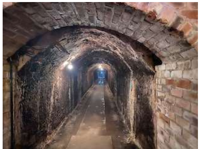
Air Temperature – a constant 15° all year round (+/- 1° to 2°)