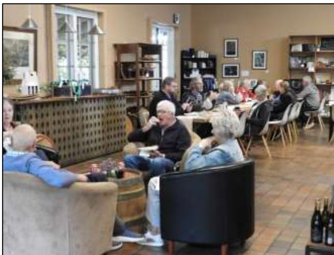
Coffee, cake and chitchat on arrival .....

Attendance included 37 members, 2 guests and 2 children