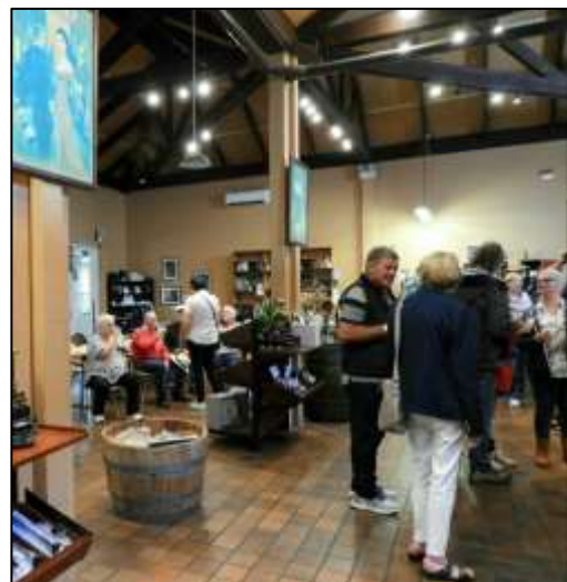
then a wine or two to finish the day!