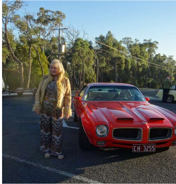
Editor driving 70 Firebird in Florence Thomson Rally