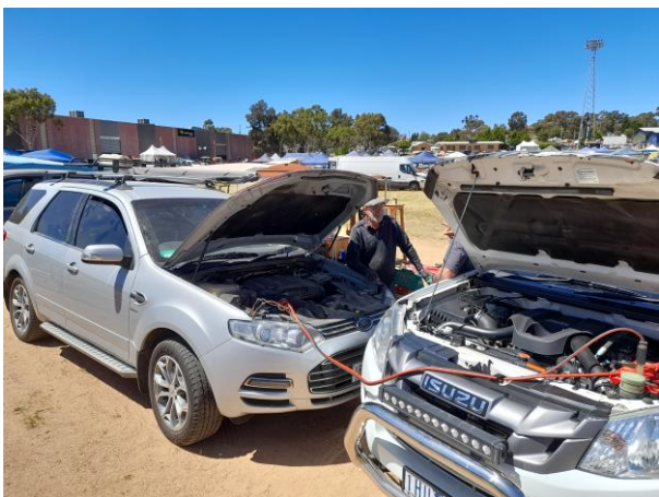
This is what happens when you leave your key on.