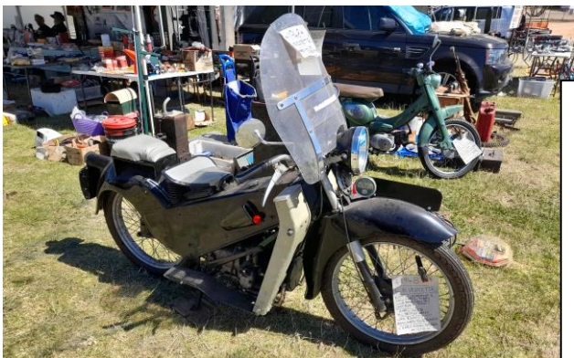
One of the ugliest bikes I have seen.