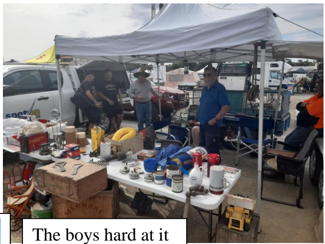
The boys hard at it