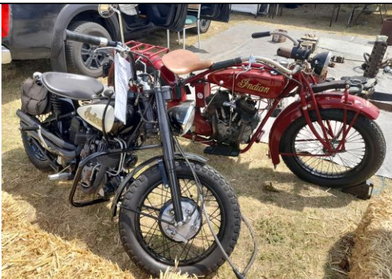
Nice pair of Indian Motor Bikes.

It was a great weekend for the Bendigo Swap with a warm Fri to set up and a cold Saturday night, the weather couldn't make its mind up. The crowds were good up until 2 pm on Saturday and slowly disappeared, Sunday was very quiet sales wise.