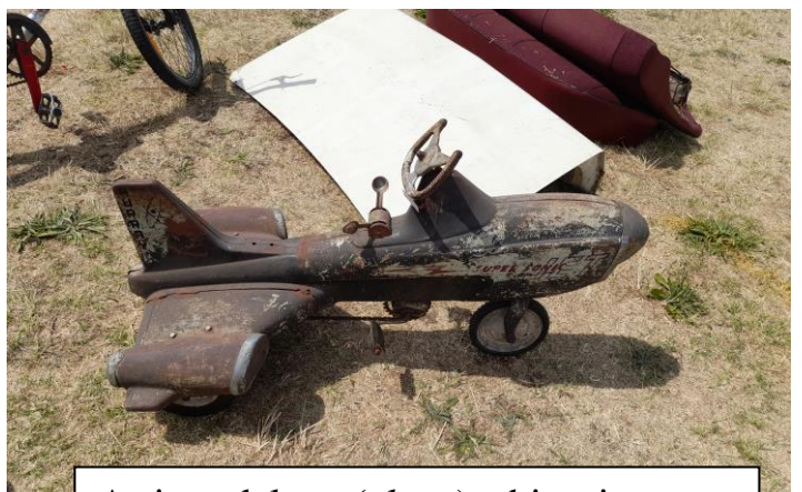
As is pedal car (plane) a bit pricey at $2750