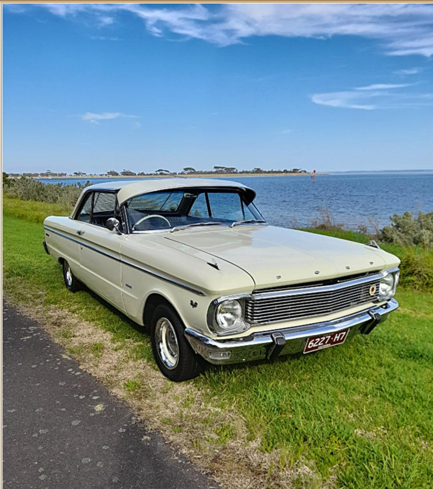
Ken Parry's 1965 XP Falcon

Club meetings: 7.30pm 2 nd Tues each month.