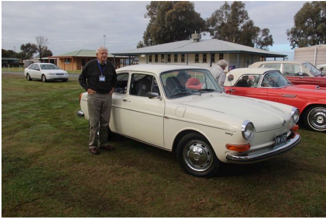
6 Seventies #148 Trevor and Caroln Reece 1973 VW Type 3