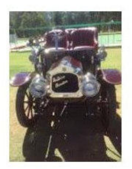
De Dion Bouton

We ended the rally with lunch at the Peppermill Inn.