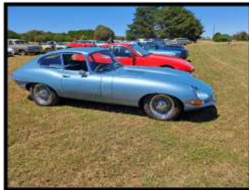
E Type Jaguar