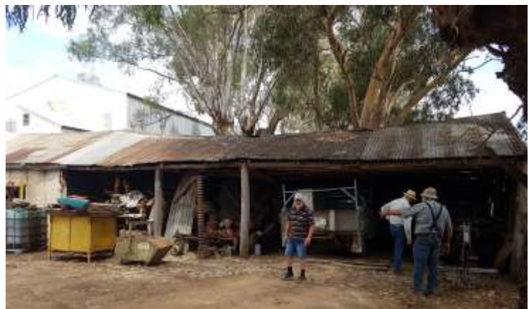
Russell Altman showing our members around his property.

The Hamilton Cemetery Trust are here to provide quality cemetery facilities for our communities. With respect, compassion and integrity; they provide us with and maintain our cemeteries. Giving us all a safe, inclusive, and accessible final resting place for our loved ones.