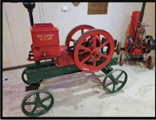
Big Chief Engine