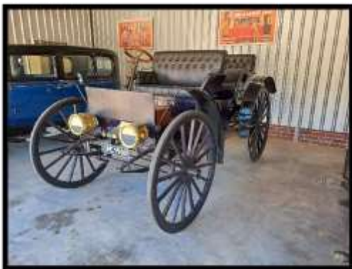
International Motor Buggy