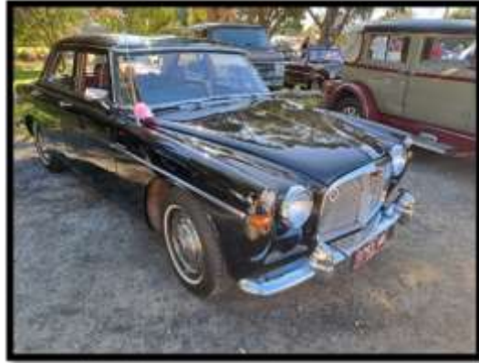
3 Litre Rover