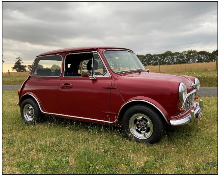
Baw Baw Old Engine & Auto Club Inc.