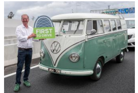
The media stars