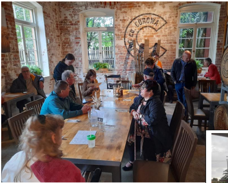
Lunch at Corowa Whisky and Chocolate Factory (well worth a visit)