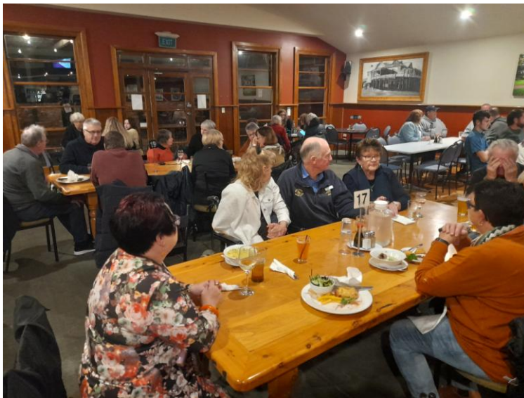
Dinner at the Rutherglen pub, a very busy place, glad we booked.