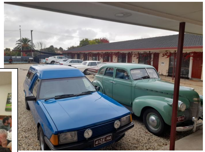
Motel at Rutherglen.