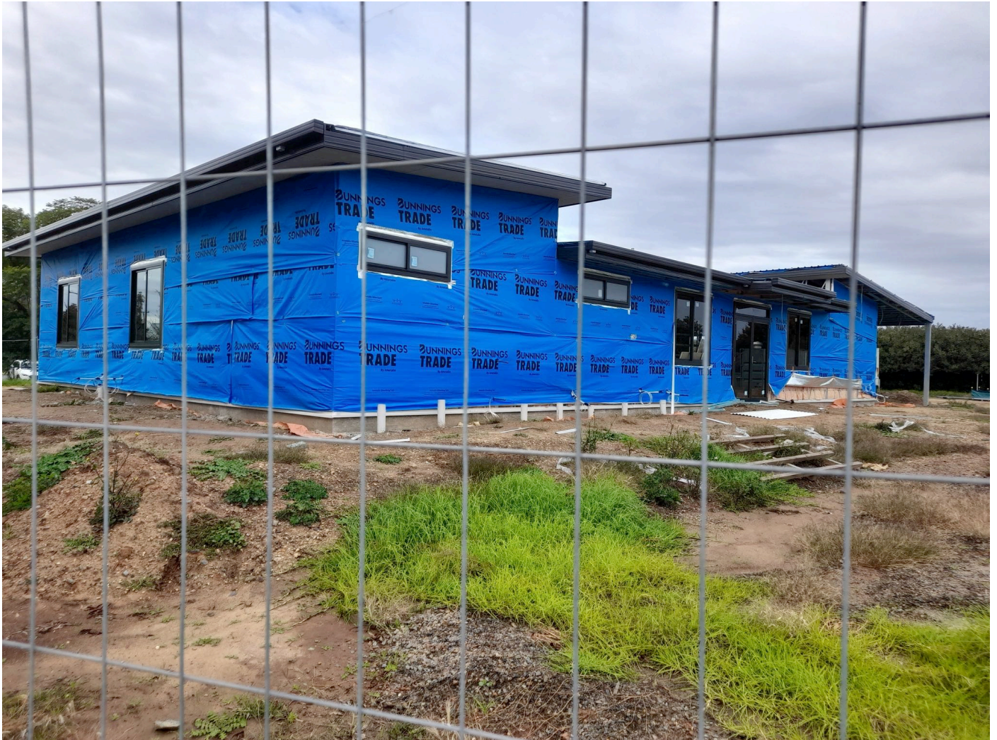
Back View 6 th May