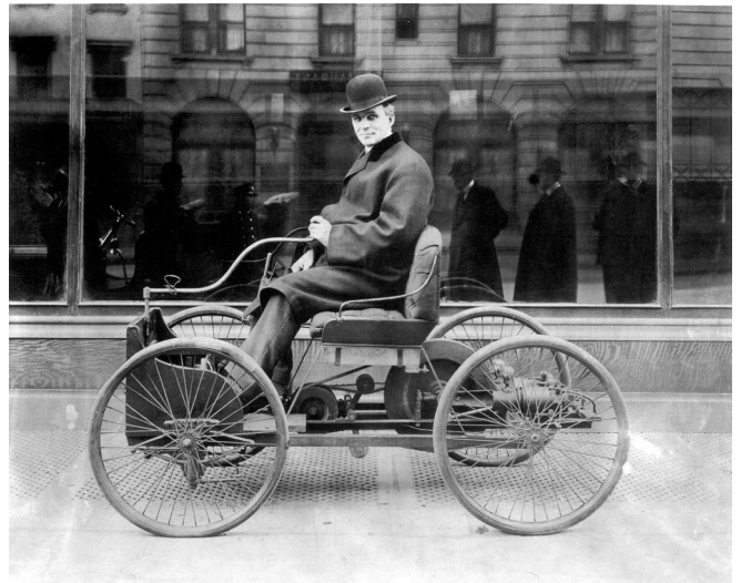
From Readers Digest - 12 Unbelievable Car Stories

The completed Quadricycle wouldn’t fit out through the workshop door. He’d built it bigger than the width of the door. Henry had to resort to using an axe and brute force to chop out the workshop’s doorframe and knock out the bricks around the door to make the opening wider. Then at last he could get his pioneering creation out for its first ever drive.