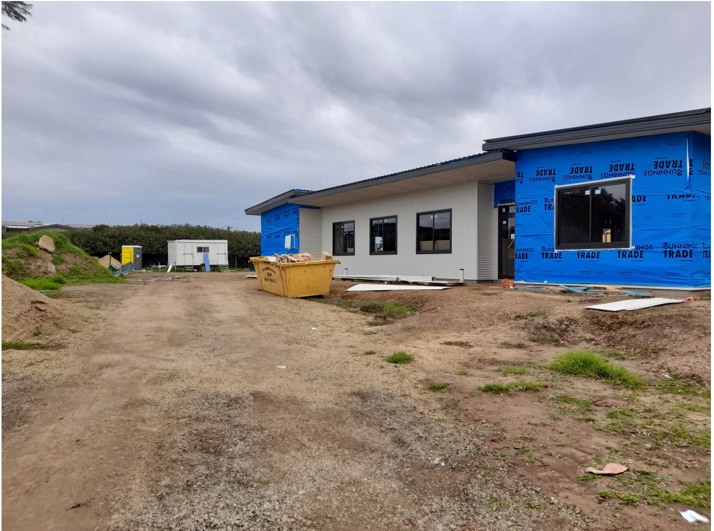
Front View Photo S Kelly 6 th May