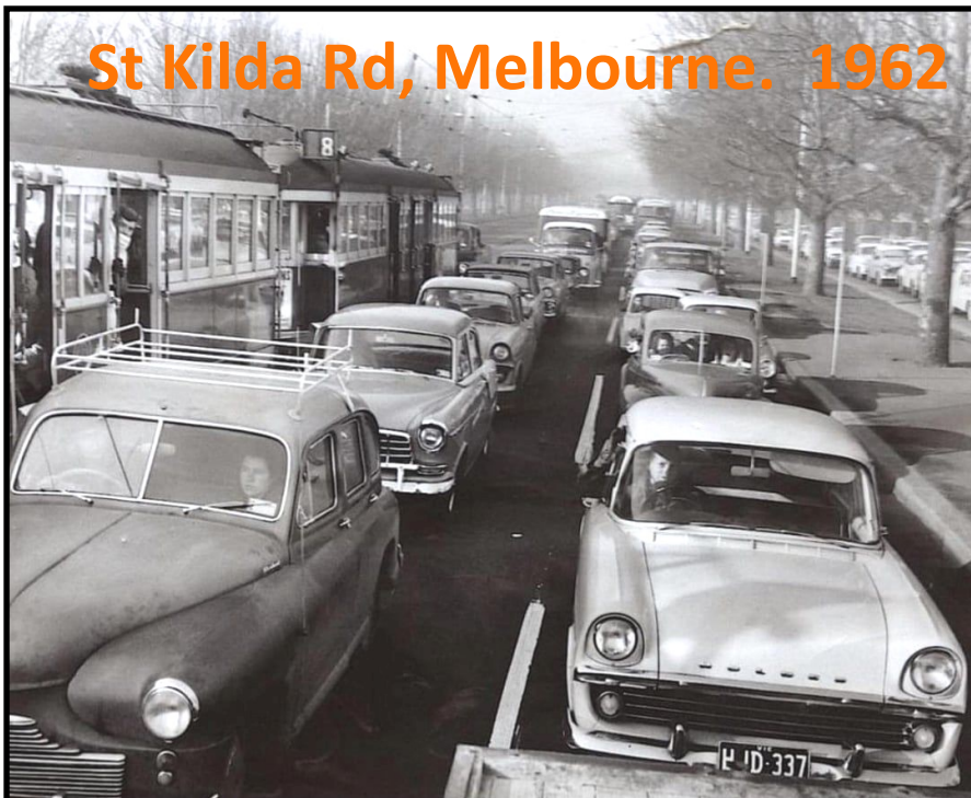
St Kilda Rd, Melbourne. 1962

MPHVC members are invited to display their car as an attraction to customers. The next Sale evening will be On 28th August in Celebration of Fathers day. Can all members participating please be parked by 4.40pm. The sale is from 5pm to 9pm. Don't forget your deckchair!