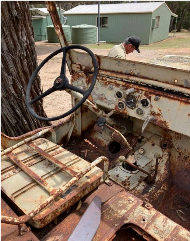
Jeep as purchased

In December 2023, the chosen vehicle became available in Ballarat, Victoria. In January 2024 we travelled from Wagga Wagga to Ballarat to pick the vehicle up.