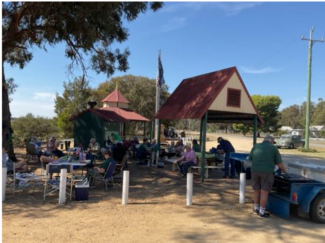
Tootool rest area