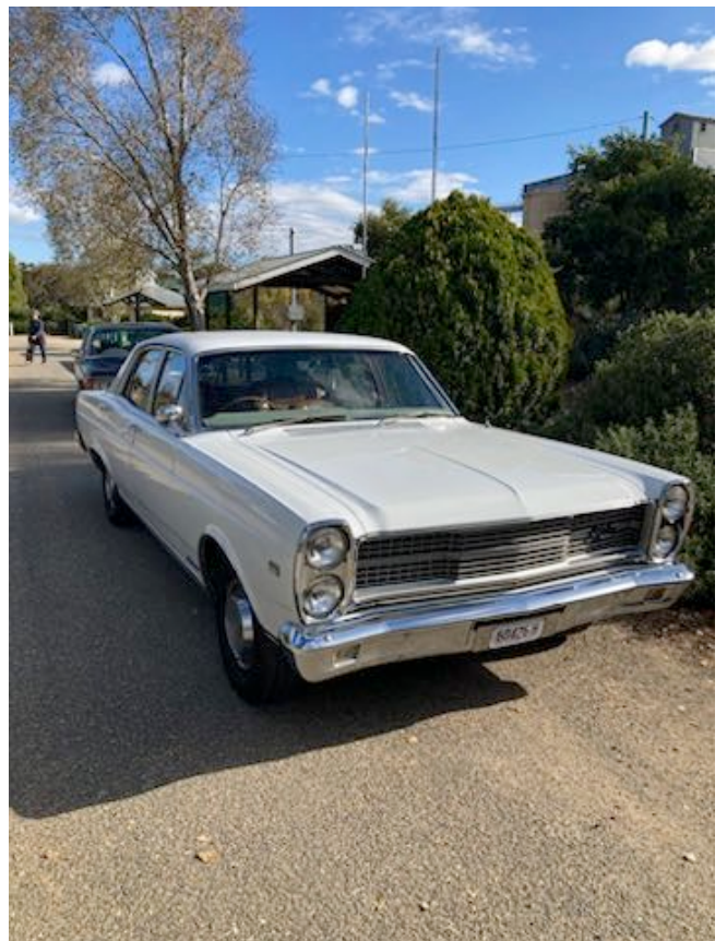
Great spot and we were looked after by the staff. A very enjoyable drive in the countryside.