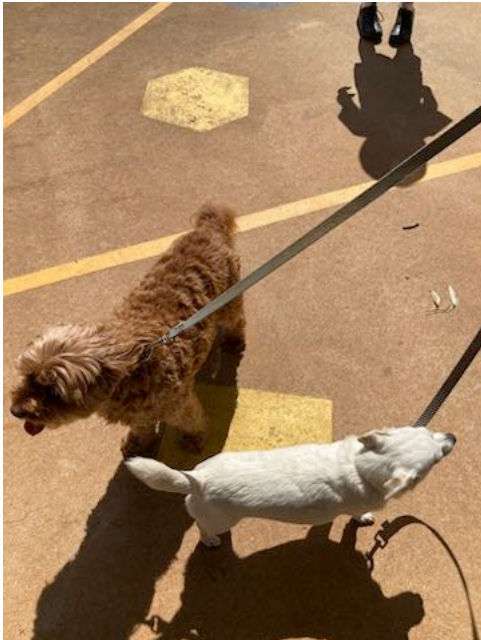
Our two four legged friends received lots of attention too.