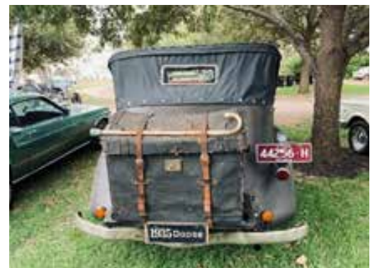
More Mortlake Picnic