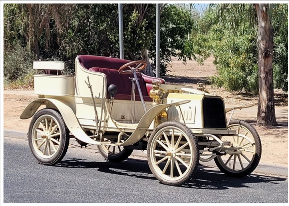
↑ 1903 CARLTON rear-entrance tonneau