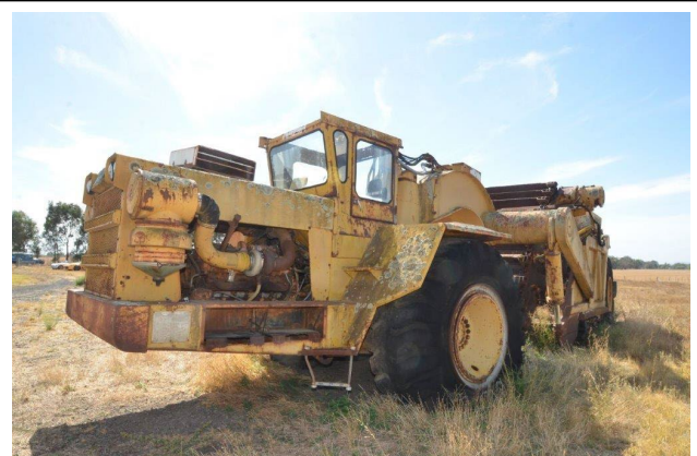
Vehicles at Nagambie