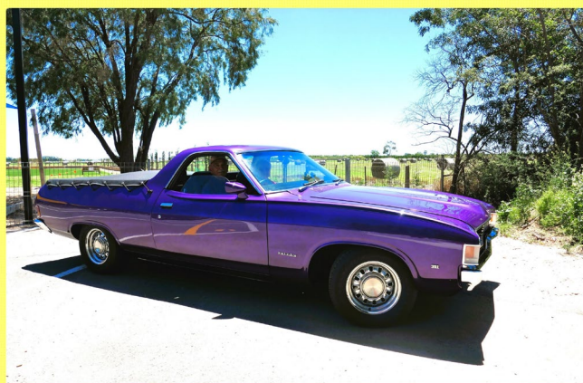
1972 FORD Falcon XA Ute Roger & Lorraine Secomb