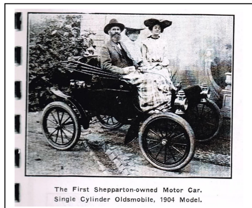
The First Shepparton-owned Motor Car. Single Cylinder Oldsmobile, 1904 Model.