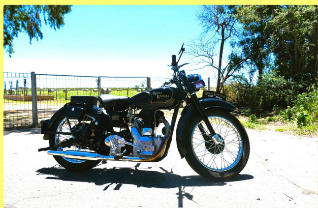
1947 ROYAL ENFIELD 500 single Terry Brennan