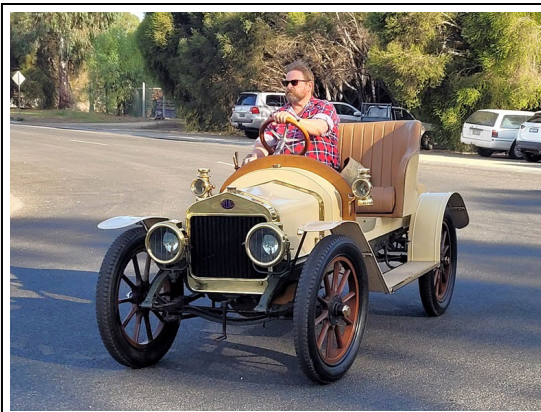
↓ Daryl's 1910 DELAGE Model F