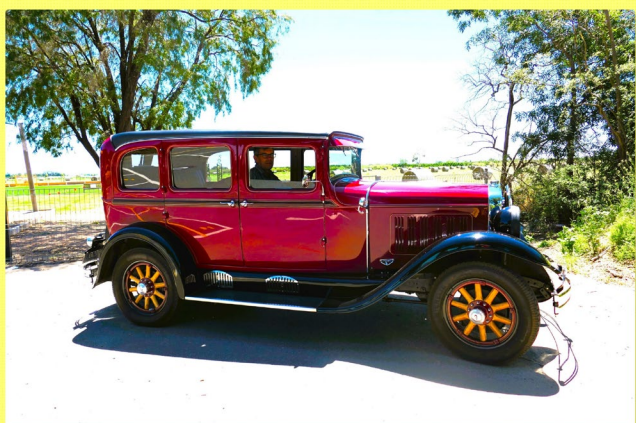
1930 ERSKINE Model 53 Sedan Lindsay Braybon