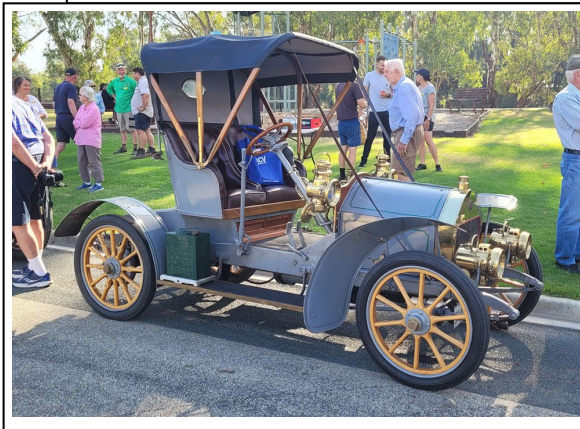
↑ 1907 DARRACQ voiture legere