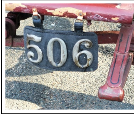
1903 HAYNES-APPERSON Model I, with an original leather number plate.