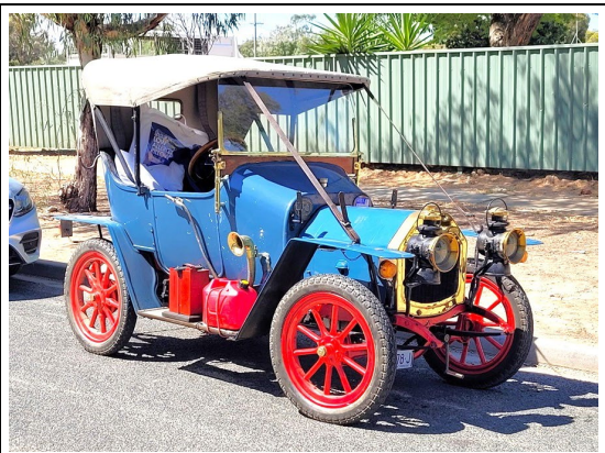
↓ 1911 LE ZEBRE