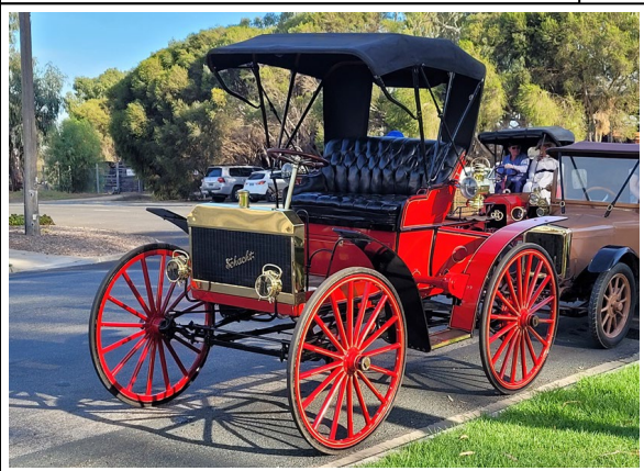
↑ 1909 SCHACHT buggy