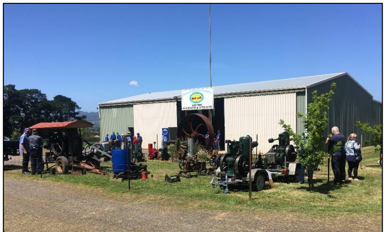
Baw Baw Picnic