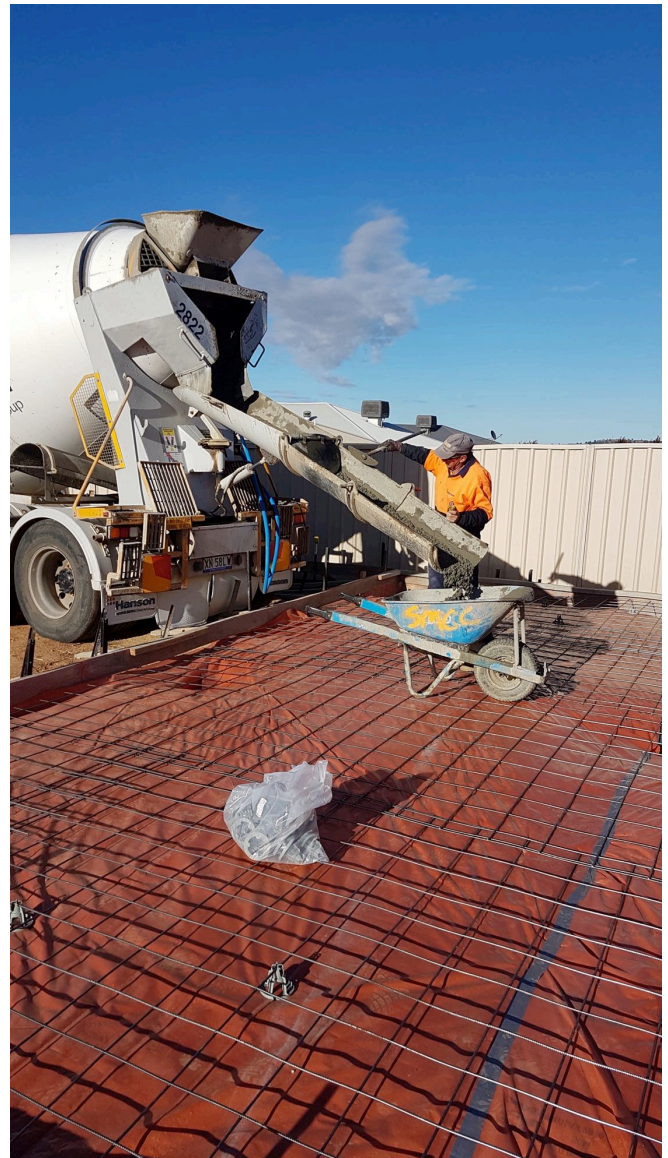
Ian Grainger delivering the concrete

“I've waited a long time due to difficulties with current Council and Planning regulations which was/ is a very drawn-out procedure.