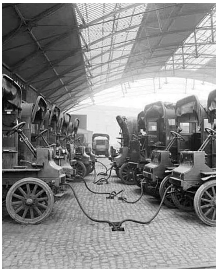
Ford Truck Club (from Facebook)

The photo is a group of working EV trucks in the UK plugged in, in 1917.