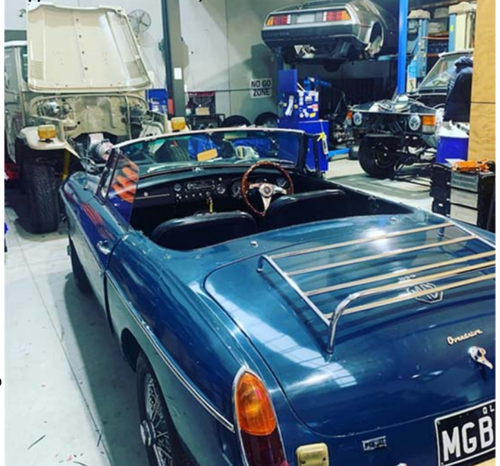
An MG Roaster in the Electric Car Cafe workshop, alongside a Land Cruiser, Range Rover, and DeLorean.