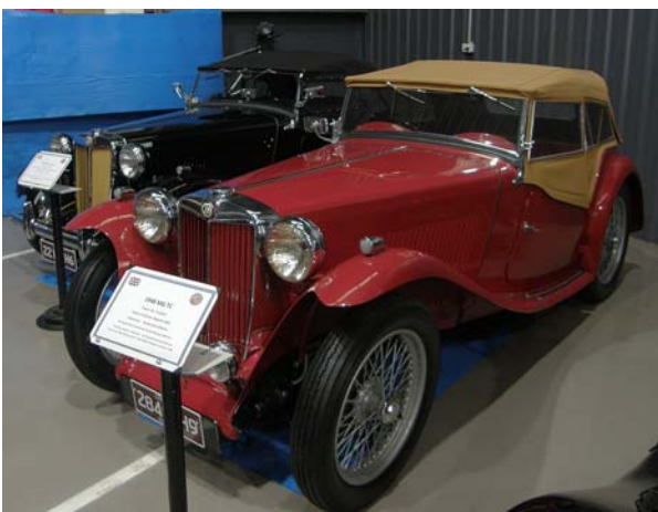
1948 MG TC