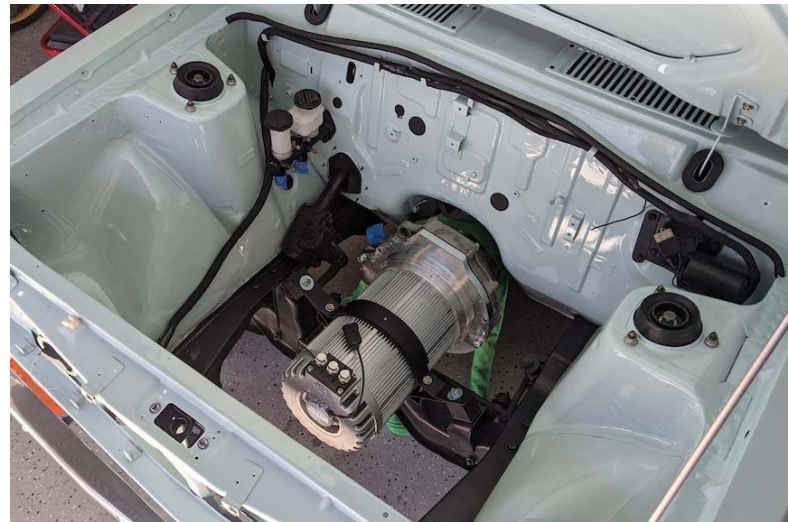
An electric motor replaces the combustion engine in the Datsun.