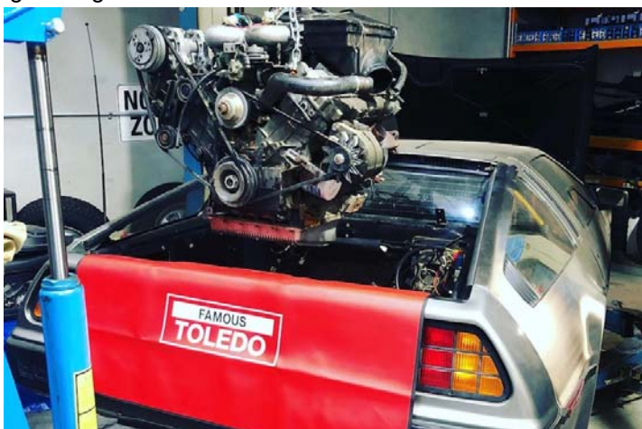
Removing the engine from the DeLorean, which is being converted to an EV.