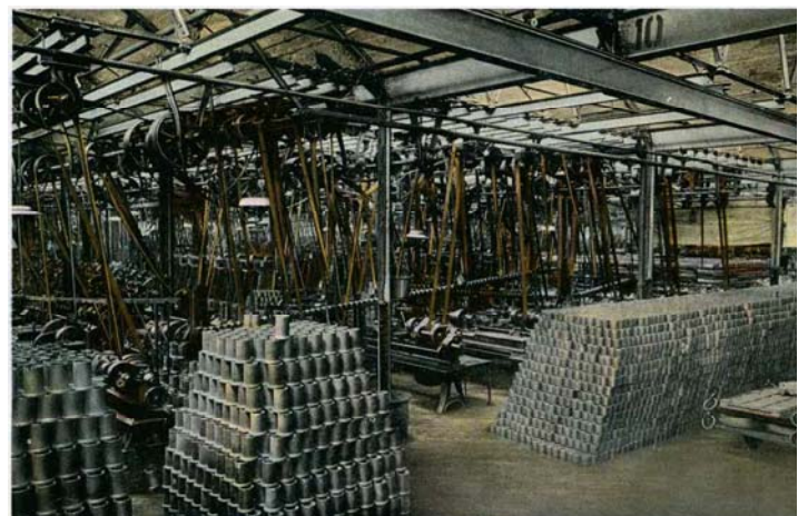
"Piston machining department. Veritable jungle of belts and shafting."

Postcards showing the Ford plant in 1917.