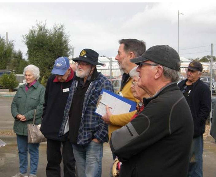
The collection warranted close inspection