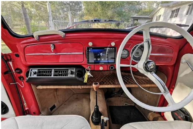
The interior is much the same, but with an LCD screen

As he points out, replacing a petrol engine with an electric motor is just another form of hot-rodding; incorporating a newly released auto-technology into a classic car, as a custom modification.