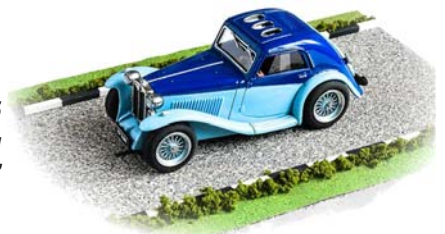
A model of a 1935 MG Magnette Airline, showing the unusual "teardrop sunroof"