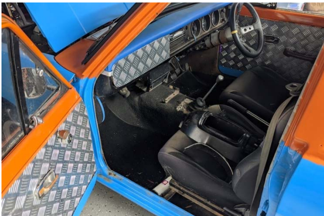
Complete with ratty carpet and sheet metal interior.