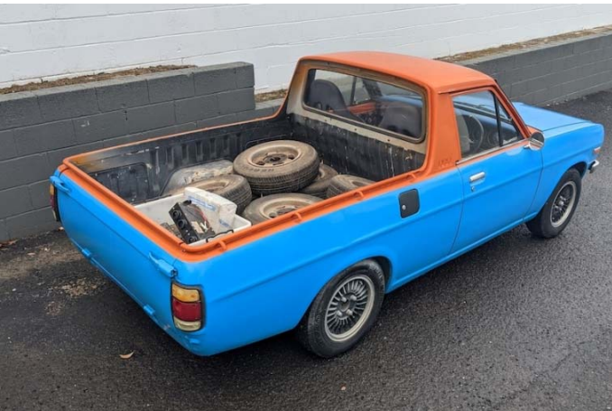
The unrestored 1981 Datsun