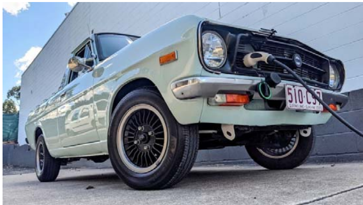
EV conversion can breathe new life into beloved older cars.

"We kept getting asked and asked and asked," he says. These weren't the usual hobbyists who "want to put a forklift motor into their Hyundai Getz", but people after "high-end conversions". "These are customers who want an alternative to Tesla, but with the mod cons." Continued Pp 12