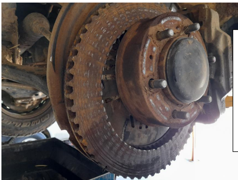
After, not such a good idea.

I come across a few beauties in my job but this one takes the cake, lack of maintenance is the cause, the owner was not happy when I wouldn't let him drive it home before it was fixed, he said the brakes worked.