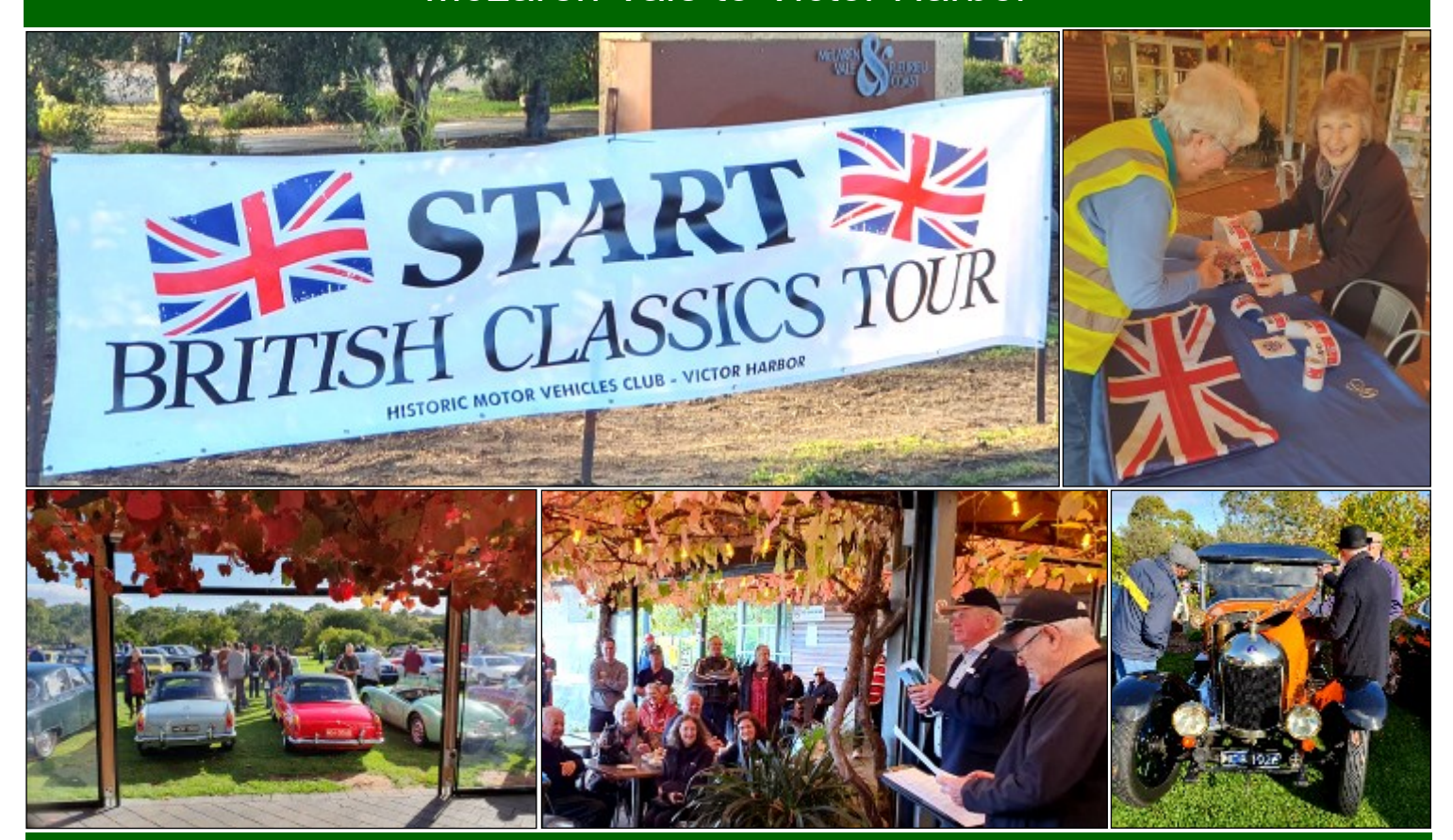
and they are off ......