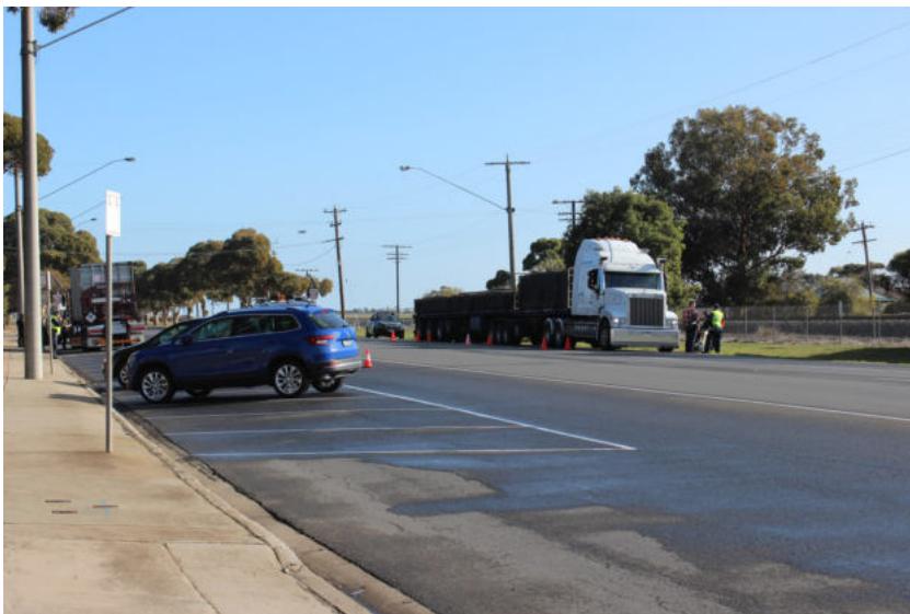
Prior to departure the Police had a checkpoint which built up as we waited