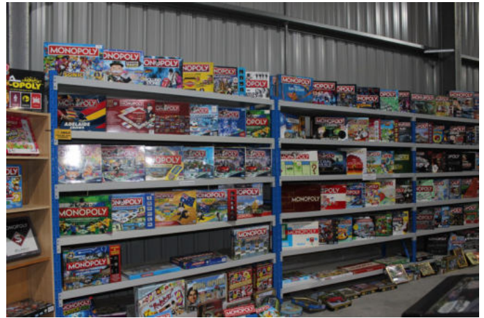
Game of monopoly anyone?