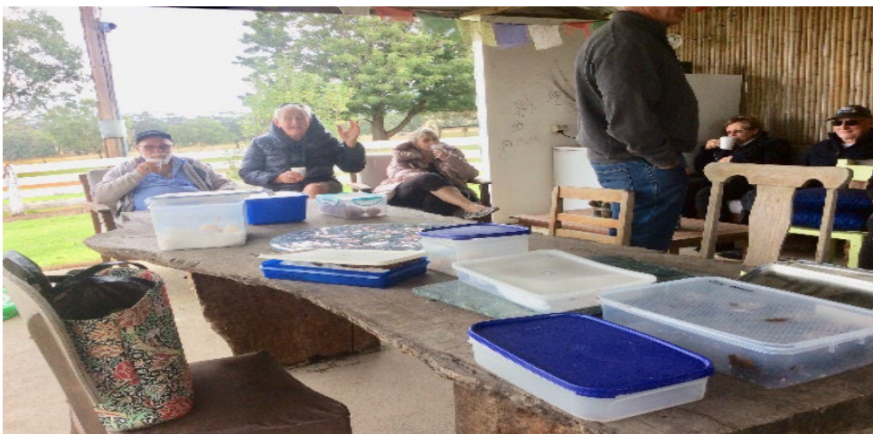
Cuppa time at Dunrobin