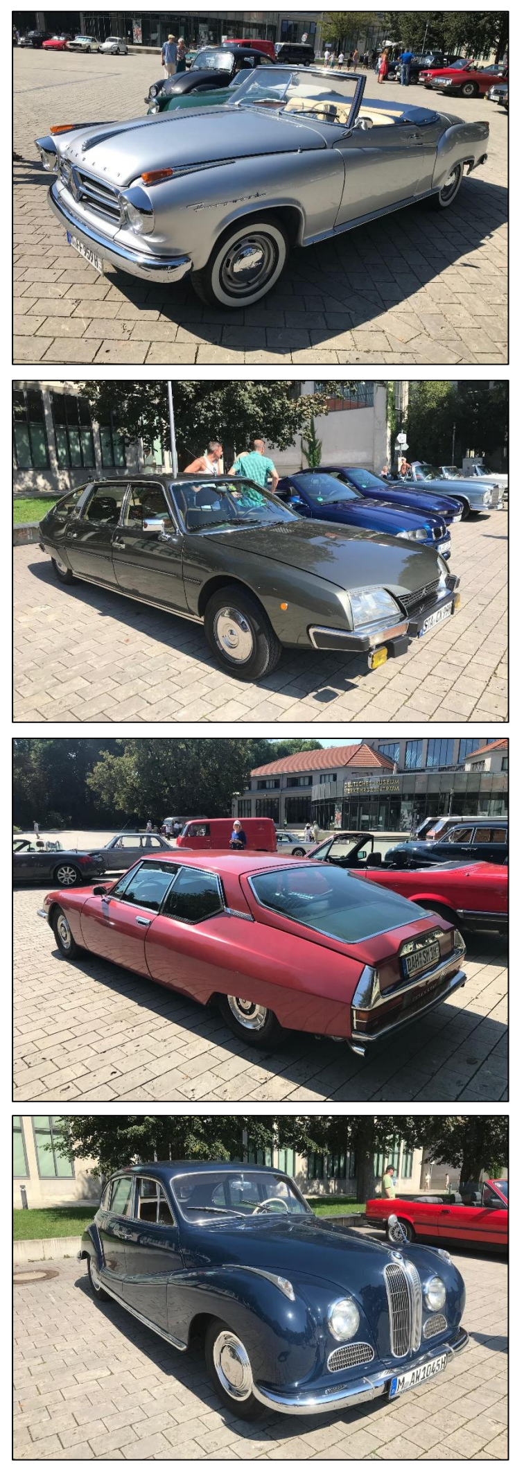
Old News - No. 205 - October 2023