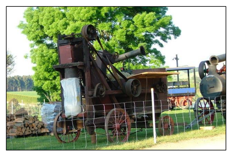
On display at our Vintage & Old Wares Expo, 2008.

While obviously showing signs of age and wear and tear, our machine is still functional and has been used for actual public displays. Rather than a full restoration, repairs are ongoing as required, maintaining it in original useable condition.