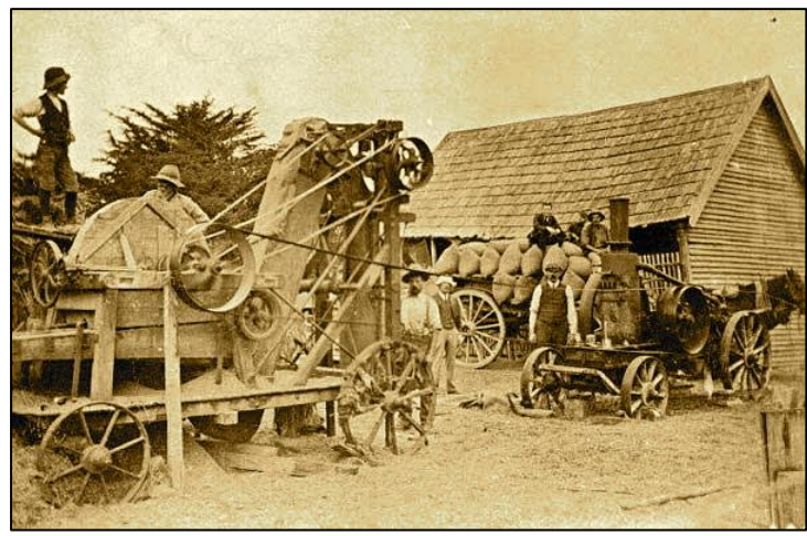
A similar machine in use