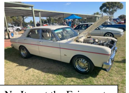
No Its not the Fairmont.