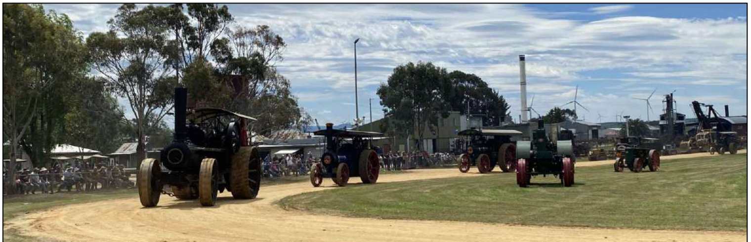
Lake Goldsmith Steam & Vintage Rally