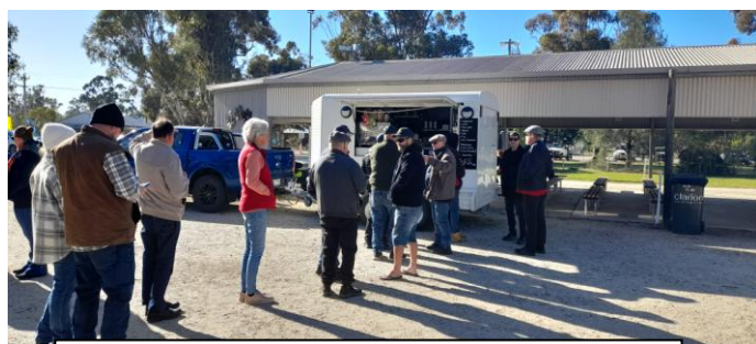
A long queue for a hot cuppa