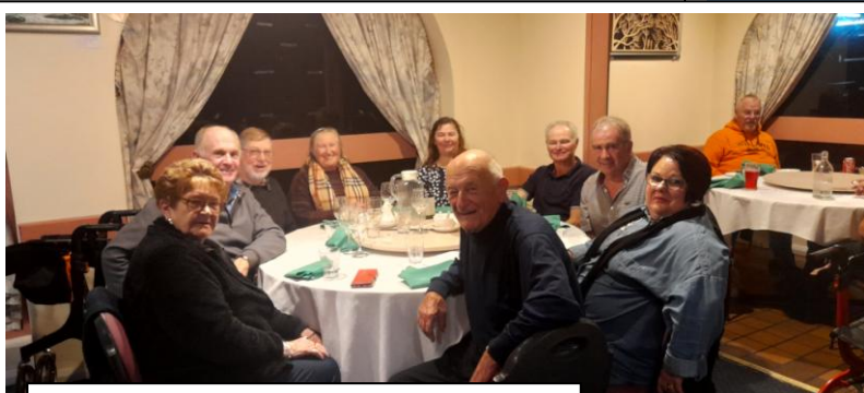
The crew out for dinner.