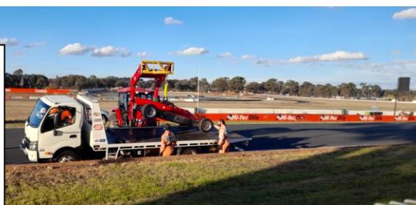
A bit of action in front of us