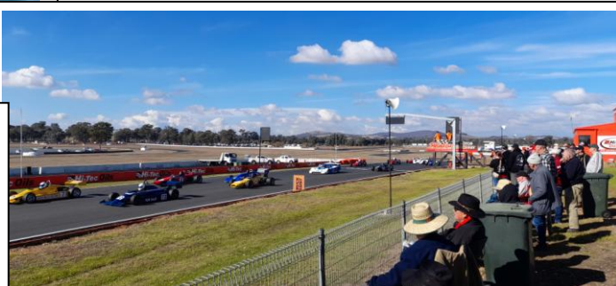
On our laps of the track