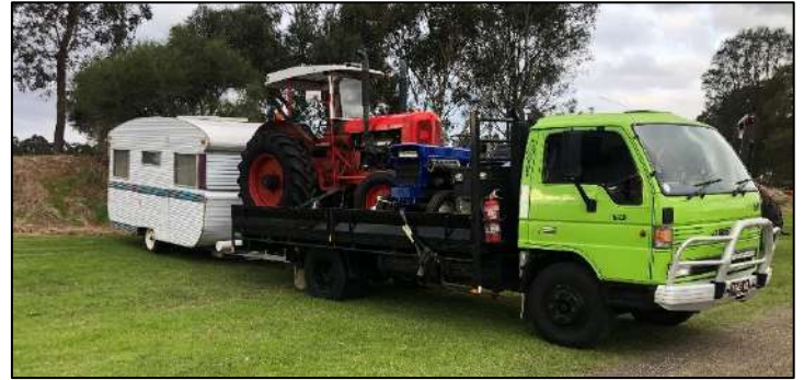
All loaded for the Heyfield Vintage Machinery Rally