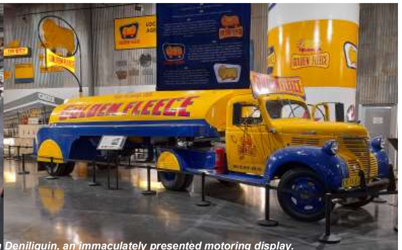
Day 3 included a stop at The Depot in Deniliquin, an immaculately presented motoring display.