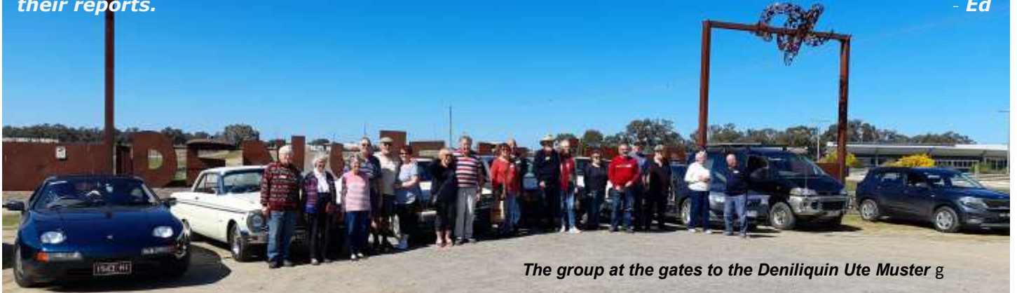
The group at the gates to the Deniliquin Ute Muster g