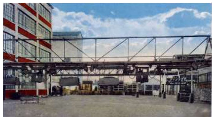
"There are over two miles of monorail track in the Ford factory."

Postcards showing the Ford plant in 1917.