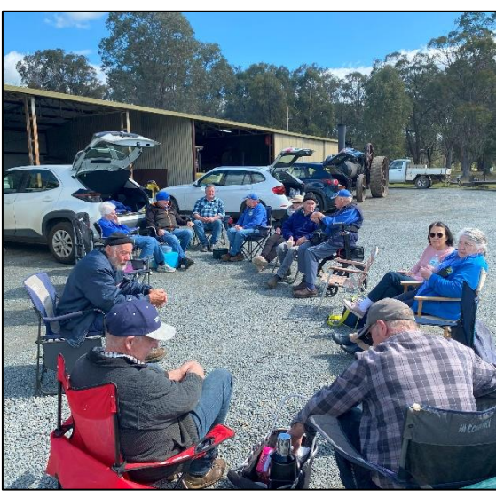
Club run to Lakeside Antique Machinery Museum