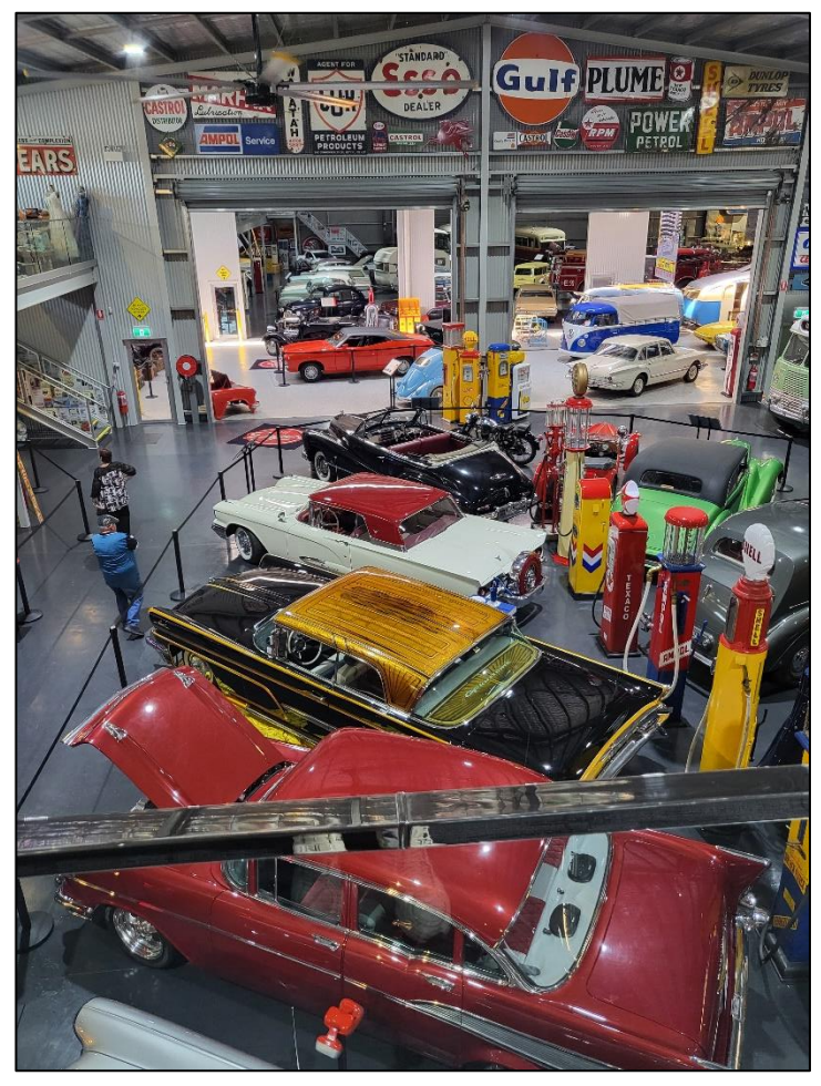
Doug & Vicki Barratt

There is a full diner next to it where you can sit and have a feed and relax and come and go as much as you want into the museum to see it all.