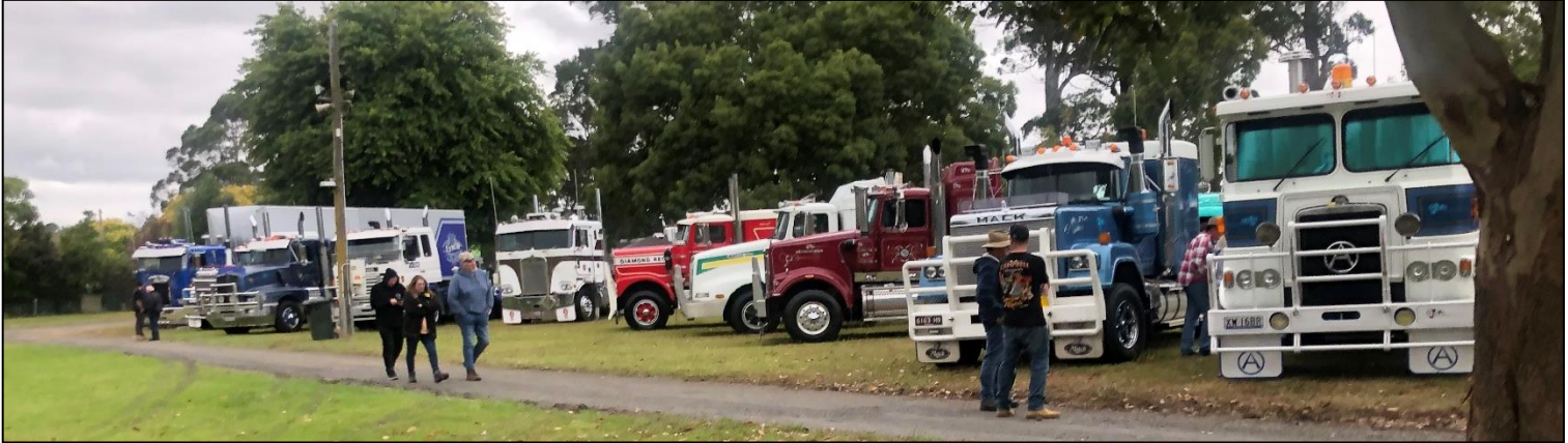
Heritage Truck and Vehicle Display at Lardner Park