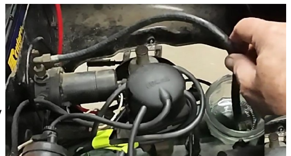
I think found I uncle Jim's problem.

wise good. Nothing to indicate a running problem. I cleaned gaped and tested the points and set up a gravity feed fuel supply and gave the old hand crank a go. That wasn't much fun. So using a 12v jump pack I cranked the engine over and heard the first sounds of life from her. Not healthy sounds, but a little life in one or two cylinders—it was a start.