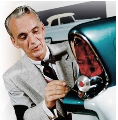
Virgil Exner with his 1955 Plymouth.

After seeing the Lockheed P-38 Lightning-inspired tailfins on the 1948 Cadillac, Exner adopted fins as a central element of his vehicle designs. He believed in the aerodynamic benefits of the fins, and even used wind tunnel testing at the University of Michigan—but he also liked their visual effects on the car. Exner lowered the roofline and made the cars sleeker, smoother, and more aggressive looking. In 1955, Chrysler introduced "The New 100-Million Dollar Look". With a long hood and short deck,