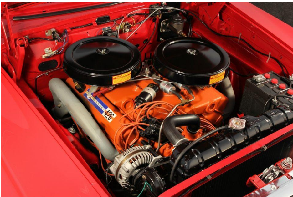
1963 Dodge 330, 426 Max Wedge

The millennial replied in a huff, "I wish you guys would get your act together. Yesterday you took my license away and today you expect me to show it to you!"