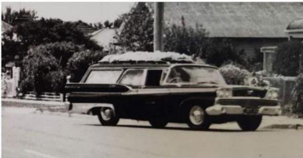
During its working life (circa 1970)