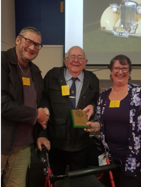
Left: Some of the happy prize winners!