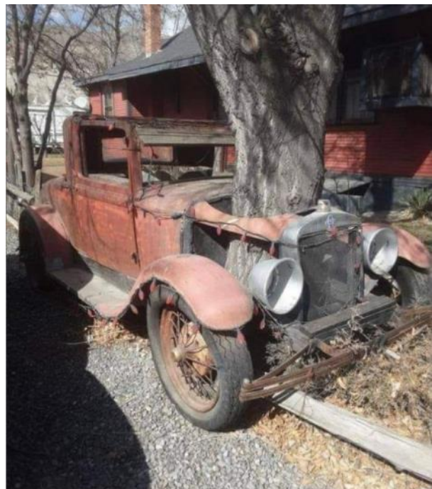
Alternative to Electric vehicles, the wood powered vehicle!

I was impressed until, upon further inquiry, I learned that he was washing dishes with hot water under his wife's supervision.